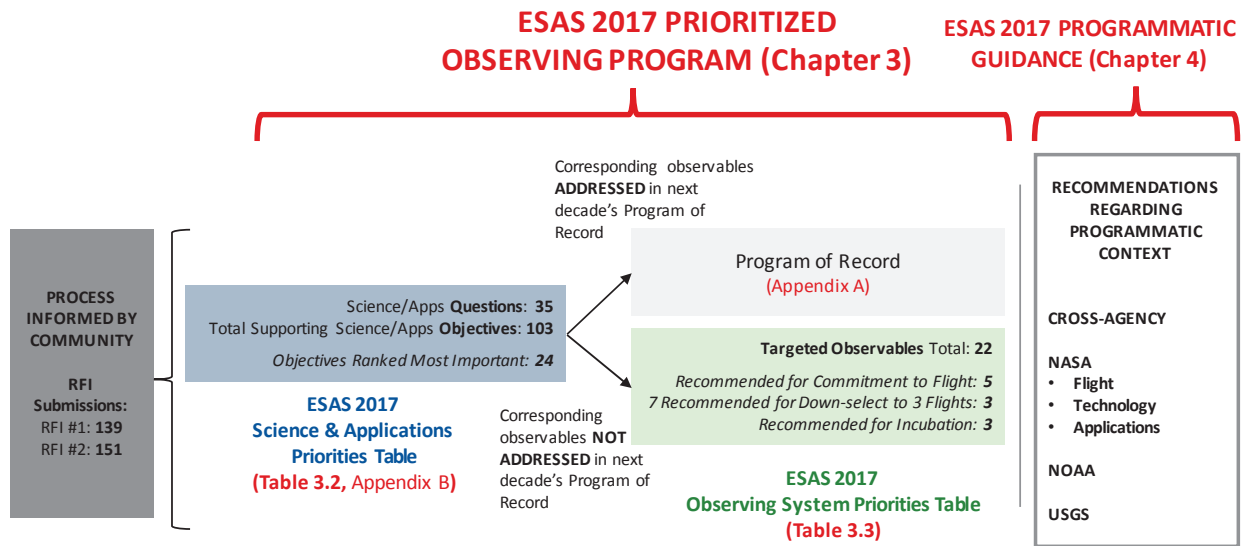
FIGURE S.1 Roadmap for the 2017 Earth Science and Applications from Space (ESAS 2017) decadal survey report based on the survey committee's approach to identifying priorities for the coming decade, starting from community requests for information (RFIs), refining this input to determine priority science and applications questions and objectives, and then identifying new observing system priorities (assuming completion of the program of record). These priorities are complemented by programmatic recommendations.

The committee conducted its work in close collaboration with the decadal survey's five study panels, each interdisciplinary and together spanning all of disciplines associated with Earth system science. The survey process is summarized in Figure S.1. It was designed to converge—from a large number of community-provided possibilities—to a final, small set of Science and Applications Priorities (shown in blue) and Observing System Priorities (shown in green) that are required to address the nation's Earth science and applications needs. This process assumed that the existing and planned instruments in the Program of Record (POR) are implemented as expected.