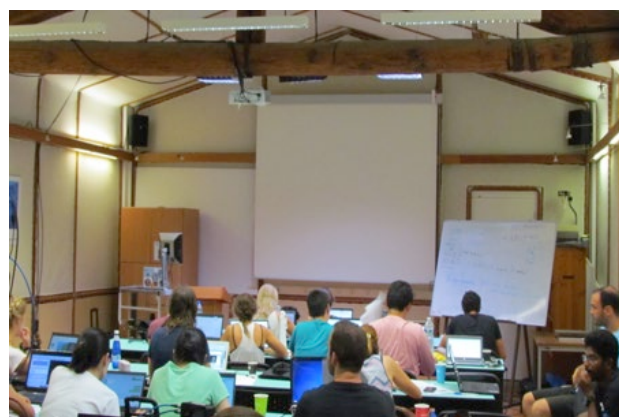
Students at work during the AC-lab practicals (left) and during the Copernicus practical in the conference room (right)

Lecturers' slots included time for interactions between the students and lecturers. Most of the lecturers attended their colleagues' lectures. Lunch and coffee breaks were also an opportunity for students to talk with the lecturers and get answers to their questions.