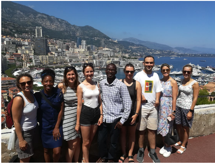
Students visiting Monaco....

... and the “Lazaret” cave and museum in Nice